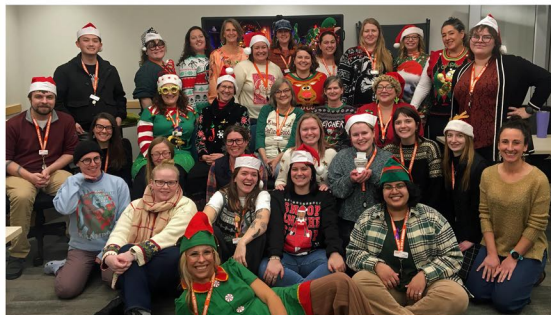
YWCA Missoula staff members, December 2023

*In Fiscal Year 2023, YWCA Missoula received $2.5M from the Bezos Day 1 Families Fund for providing services to houseless families. $50,000 was allocated for FY23 and the remaining $2.45M for the next four years. While this grant presents an opportunity for significant program improvements, the key challenge lies in establishing a sustainable strategy to cover ongoing costs, including staffing, once the funds are exhausted.